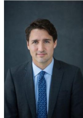
The Rt. Hon. Justin P. J. Trudeau, P.C., M.P. Prime Minister of Canada