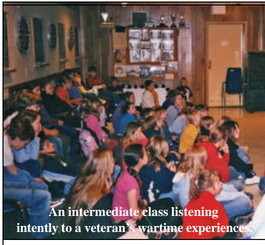
An intermediate class listening intently to a veteran's wartime experiences.