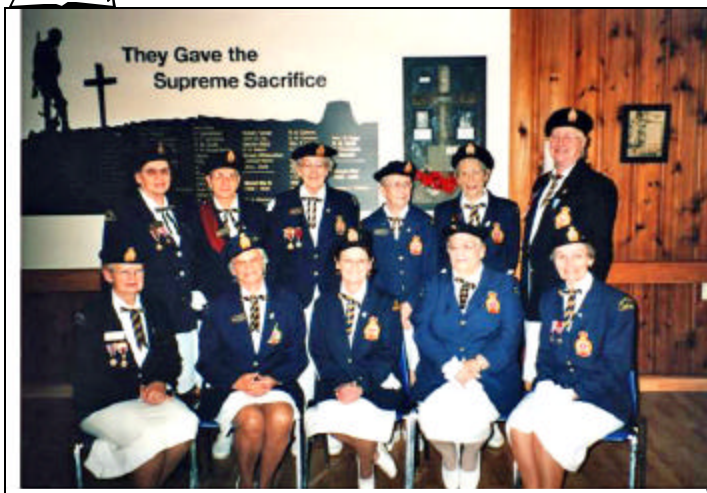
Officers and Executive 2007