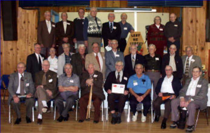
Of the 42 veterans, 16 were unable to stay for the photograph

On May 12 2005, 42 WWII Veterans, 69 members from the Dutch community, and 3 guests celebrated the 60 th Anniversary of the end of the Nazi occupation and starvation of Holland.