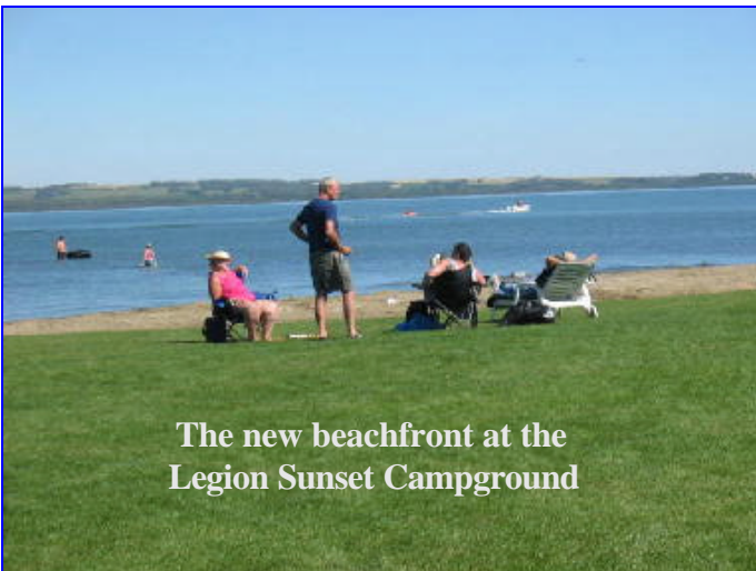
The new beachfront at the Legion Sunset Campground

Since incorporation in 1926 the Legion membership has changed considerably. Legions throughout Canada have many members with young families. Some are taking active roles in their Community through the facilities the Legion provides. Join to participate.