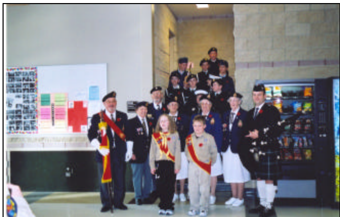
Branch #79 members and other groups visit the Blackfalds schools during Remembrance Week.