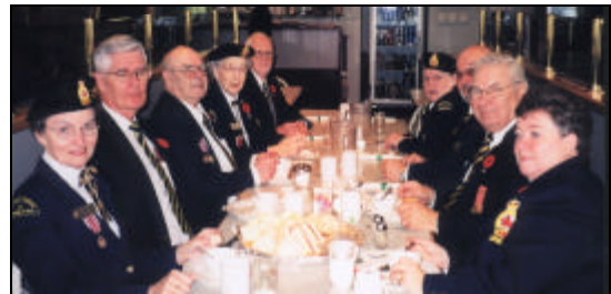
Branch #79 members taking a lunch break between school visitations in the Lacombe area

Contact the FCSS for more information. Phone 782 6637